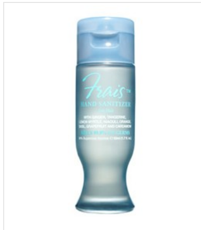
Frais Hand Sanitizer

You're a sucker for a wet wipe and you carry your anti-bac everywhere you go, some might say you're a bit of a clean freak. Or perhaps just clean!