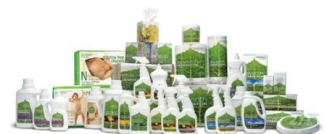
Seventh Generation Guide View this Buyer's Guide

Helping you find the right products for you and the environment.