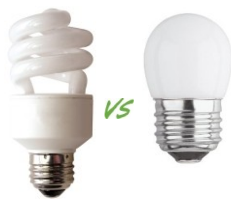
CFL Light Bulb vs. LED Light Bulb. View this face-off

Conventional products go toe-to-toe with greener products.